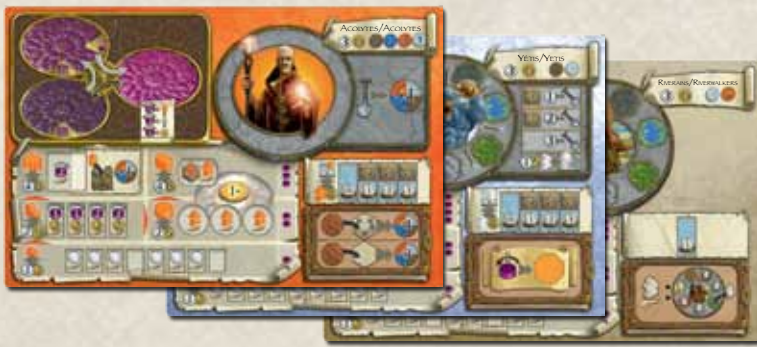
3 double-sided Faction boards (each side displays a different faction)