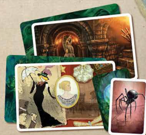
54 ghost's cards • 18 character cards • 18 location cards • 18 item cards