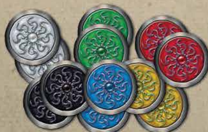
12 psychics' tokens