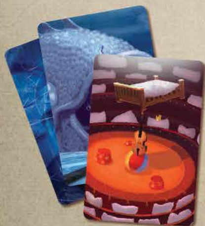
84 dream cards