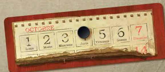
Calendar board a day marker