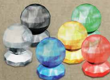
6 magic balls