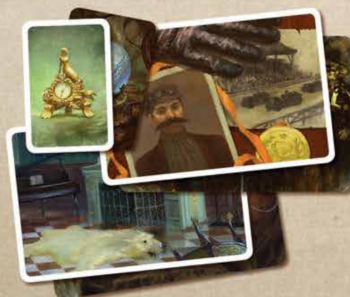
54 physics' cards • 18 character cards • 18 location cards • 18 item cards