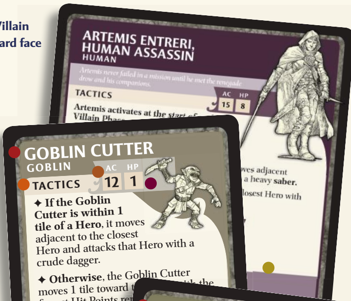
Villain card face

Some adventures require Heroes to escape from the dungeon. To escape from the dungeon, your Hero needs to be on the specified location (such as the ladder square on the Start tile or the stairs on the Surface Hollow tile) at the end of your Hero Phase. Unless the adventure specifies otherwise, once your Hero has escaped from the dungeon, you no longer take your Hero Phase or Exploration Phase, or draw Encounter cards, but you do continue to take your Villain Phase and activate any Monster cards or Trap cards that you control.