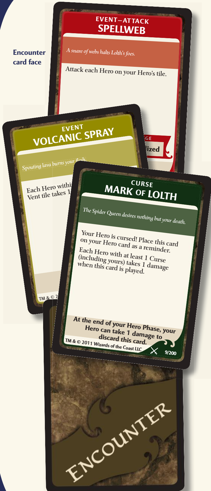
Encounter card back