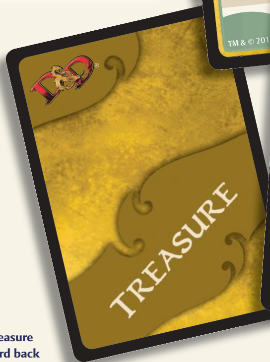
Treasure card back