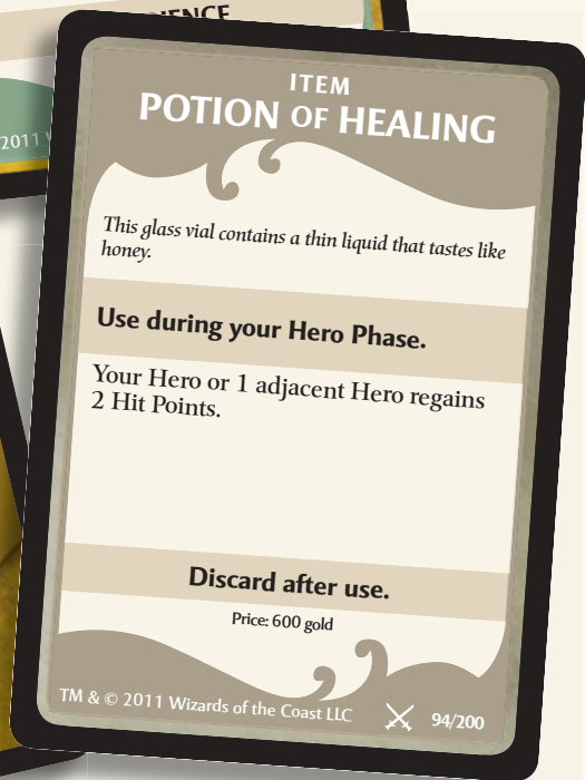
Treasure card face